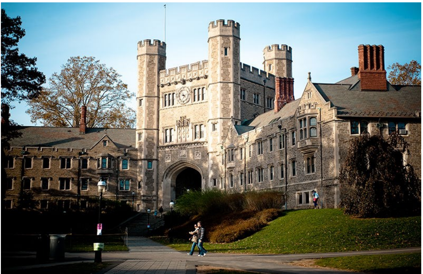
Blair Hall, Princeton University